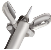
Oval Cups with Spike