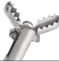
Serrated Oval Cups