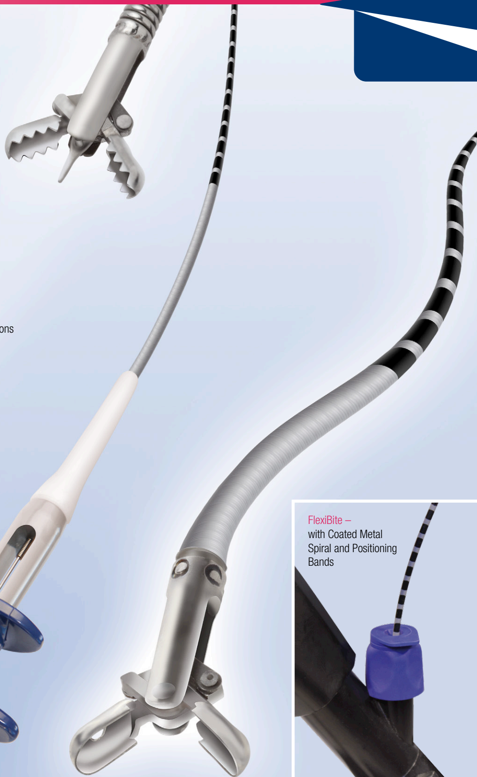
FlexiBite – with Coated Metal Spiral and Positioning Bands